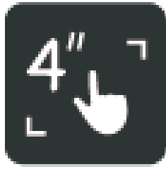
4-inch Multi-touch Screen